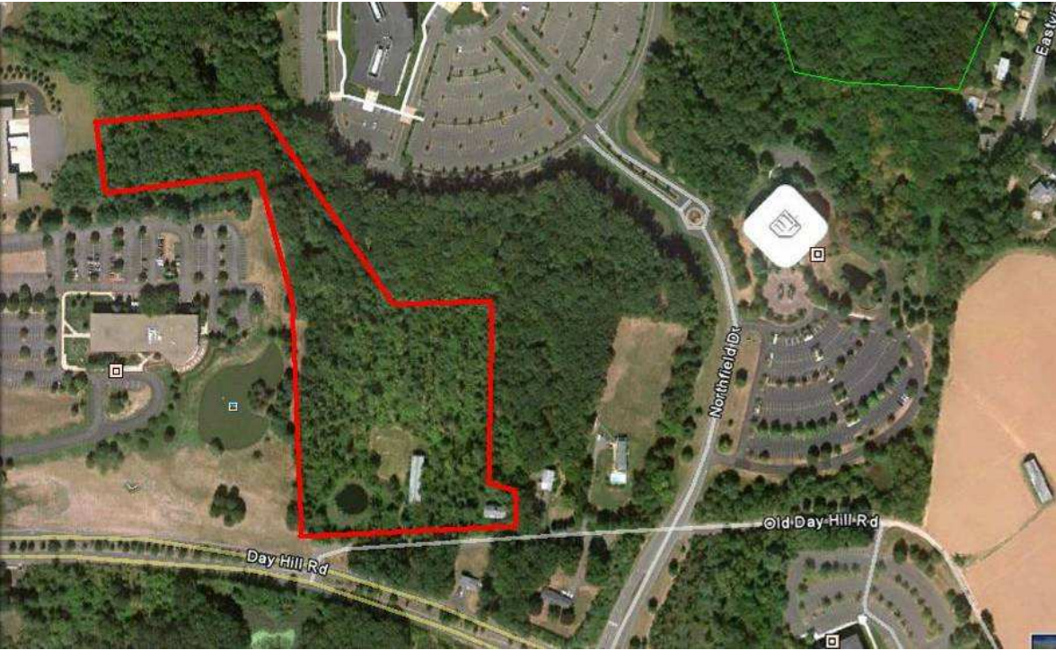
Note the two structures on the map; the tobacco shed lower center and the potato barn lower right.