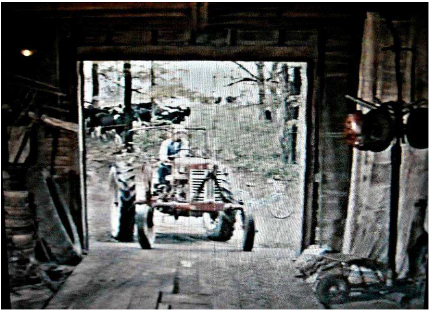
The scene from the film "Parrish" shows the interior of Potato Barn looking east with the cows in the background.